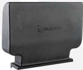
TREMOR-EXT +3dB OUTPUT