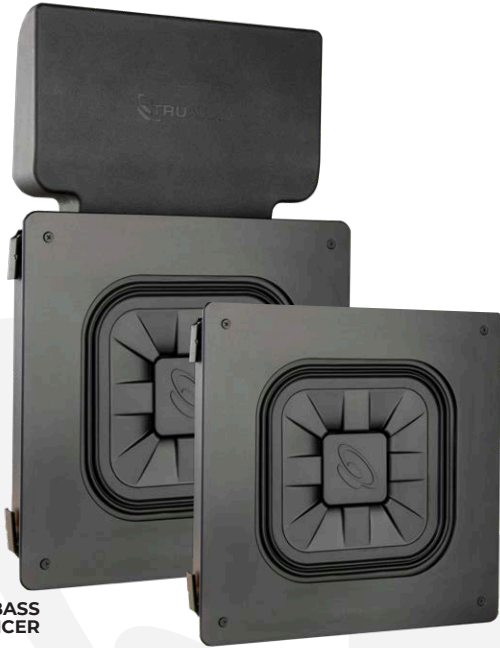
WITH BASS ENHANCER