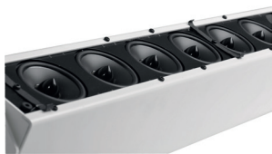
Front without grille